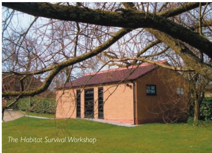
The Habitat Survival Workshop

Activities include habitat conservation awareness, pond-dipping, river studies, woodland exploration and classification of species, most of which are directed towards KS1 and KS2 pupils.